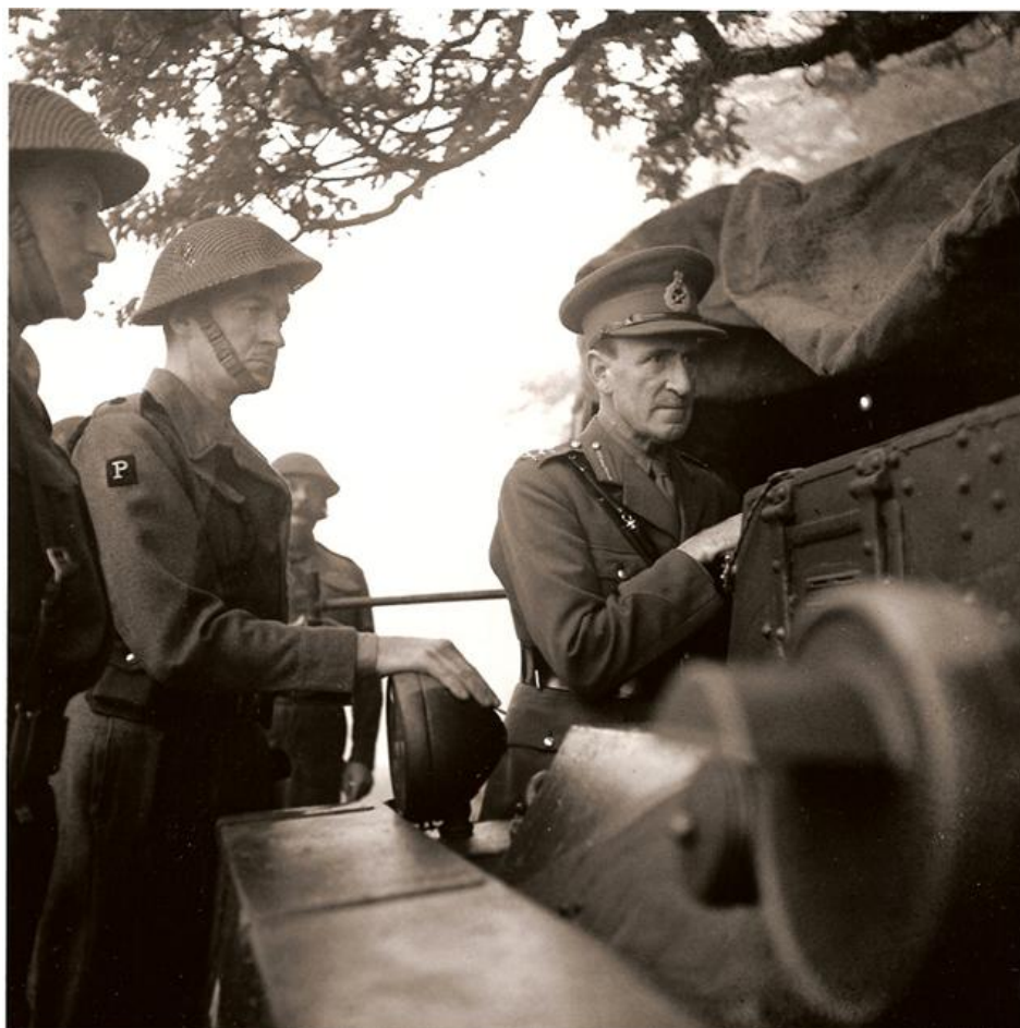
Description: Inspection by senior officer of the Phantom Regiment. Date Unknown